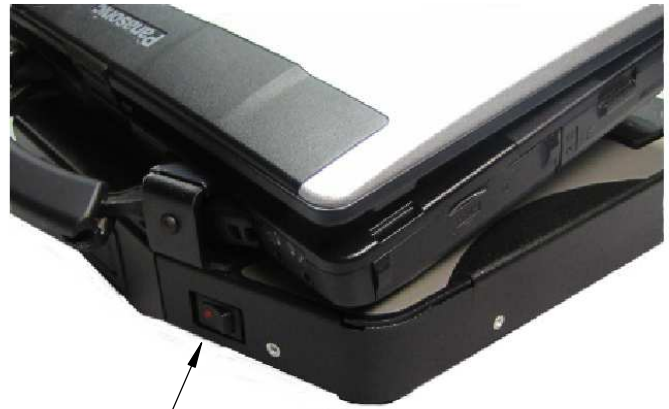
Dock Power Switch